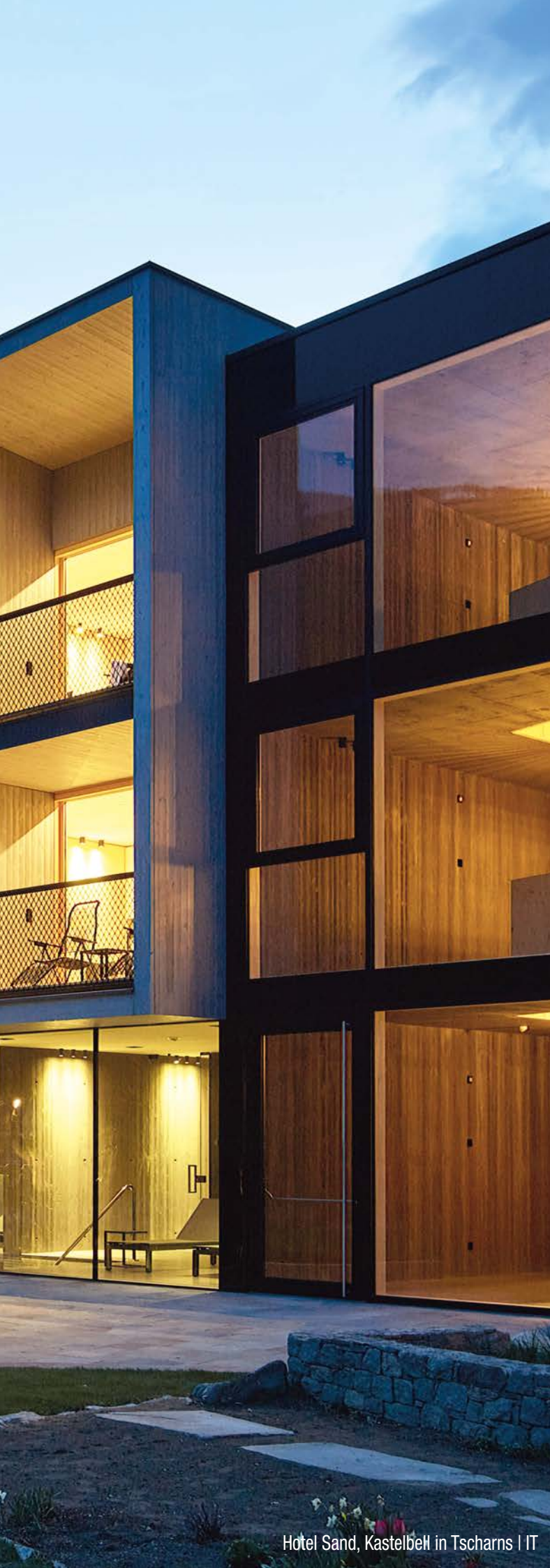
Hotel Sand, Kastelbell in Tscharns | IT