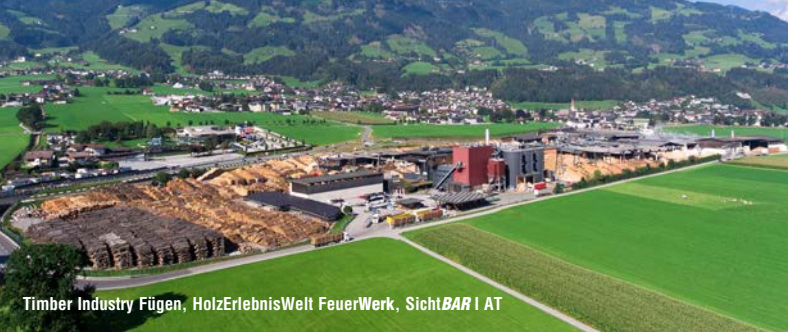
Timber Industry Fügen, HolzErlebnisWelt FeuerWerk, SichtBARI AT