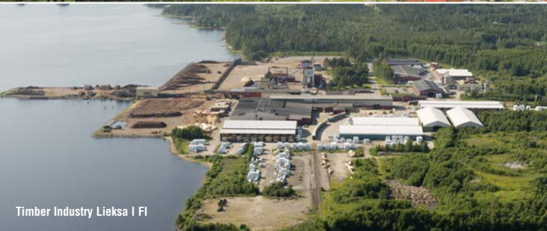
Timber Industry Lieksa I FI