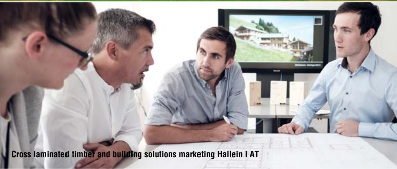
Cross laminated timber and building solutions marketing Hallein I AT