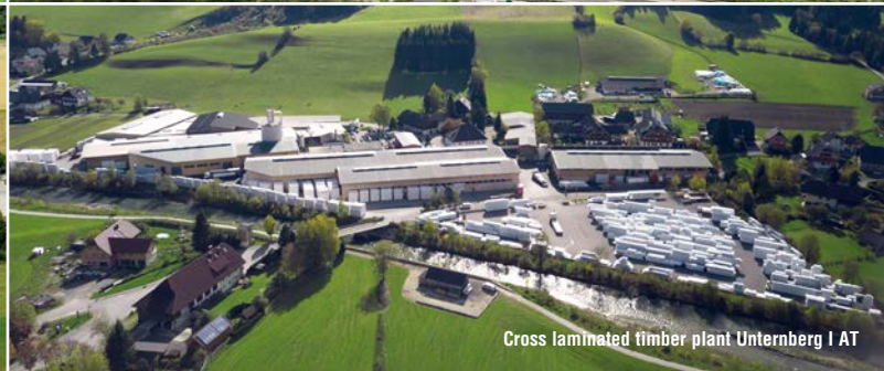
Cross laminated timber plant Unternberg I AT