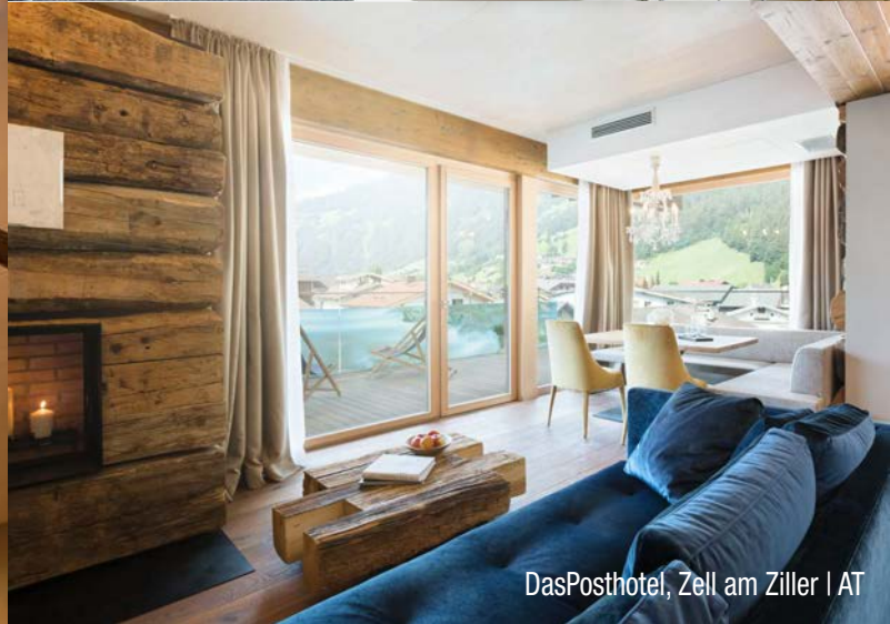
DasPosthotel, Zell am Ziller | AT