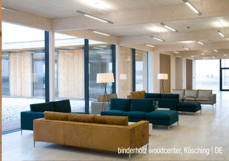
binderholz woodcenter, Kösching | DE