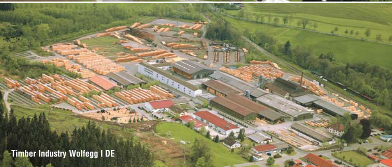
Timber Industry Wolfegg I DE