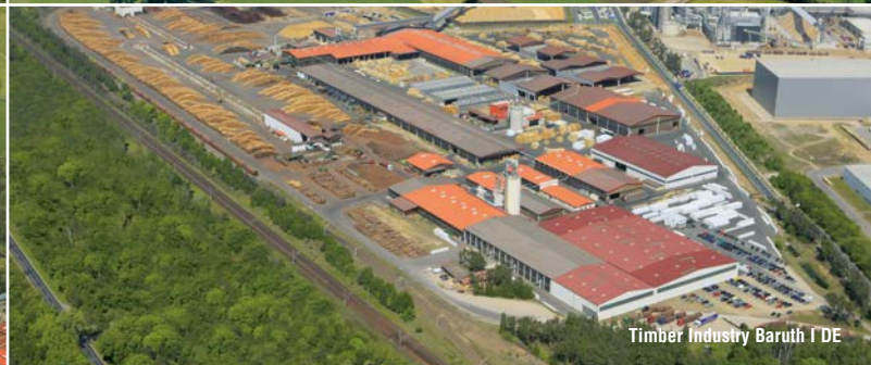
Timber Industry Baruth I DE