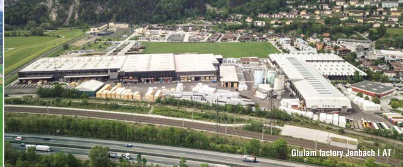
Glulam factory Jenbach I AT