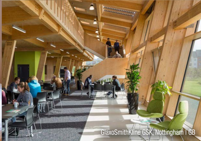
GlaxoSmithKline GSK, Nottingham | GB