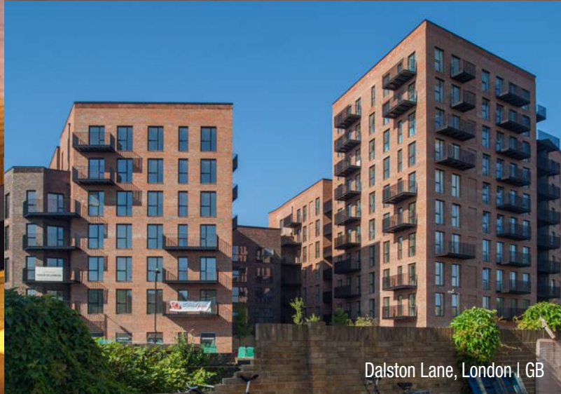
Dalston Lane, London | GB