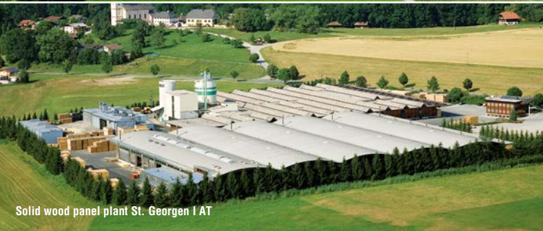
Solid wood panel plant St. Georgen I AT