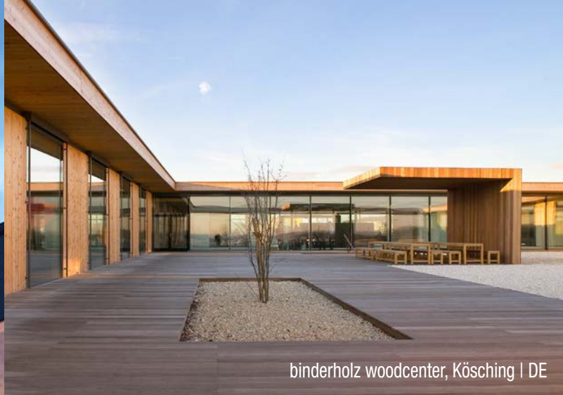
binderholz woodcenter, Kösching | DE