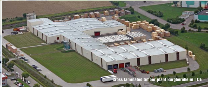
Cross laminated timber plant Burgbernheim I DE