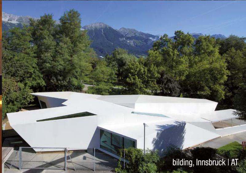
bilding, Innsbruck | AT