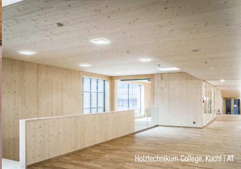
Holztechnikum College, Kuchl | AT