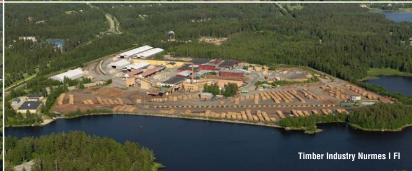
Timber Industry Nurmes I FI