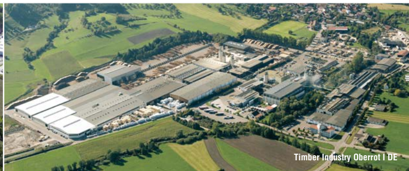
Timber Industry Oberrot I DE