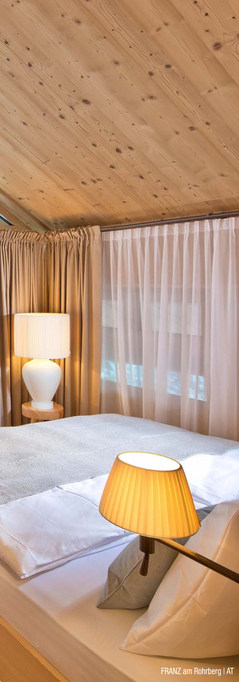
FRANZ am Rohrberg | AT