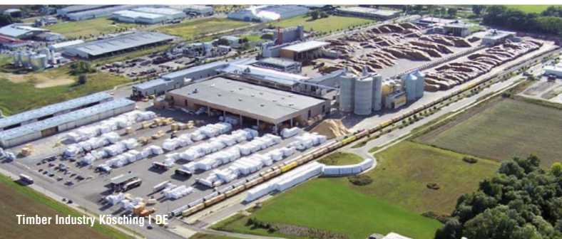
Timber Industry Kösching I DE

A workforce of 2,530 operates out of five sites in Austria - Fügen, Jenbach, St. Georgen, Hallein and Unternberg - five sites in Germany - Kösching, Burgbernheim, Oberrot, Wolfegg and Baruth - and two sites in Finland - Lieksa and Nurmes.