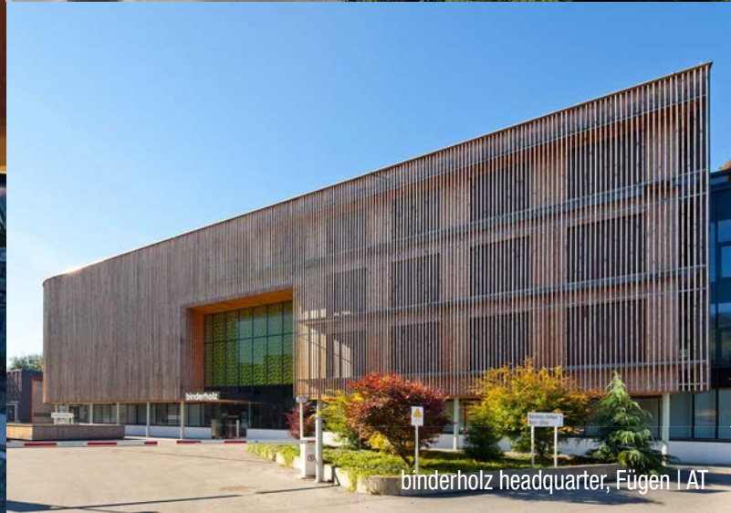
binderholz headquarter, Fügen | AT